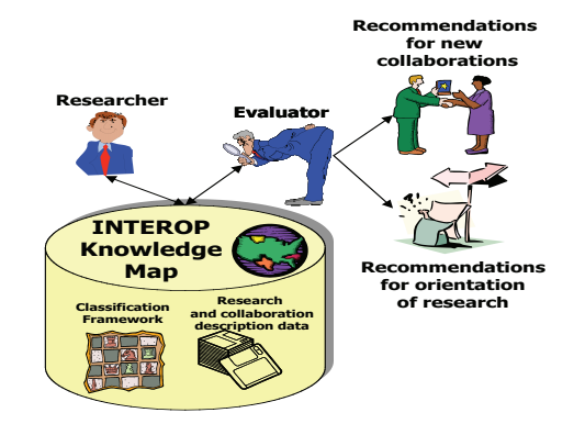
Figure 1. The INTEROP KMap.

These objectives and targets can be considered relevant for any scientific web community in any research field.