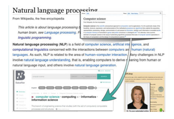
Fig. 3. Computer science Wikipedia link with its relative Babel synset.